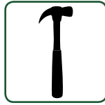
Hammer or Rubber Mallet